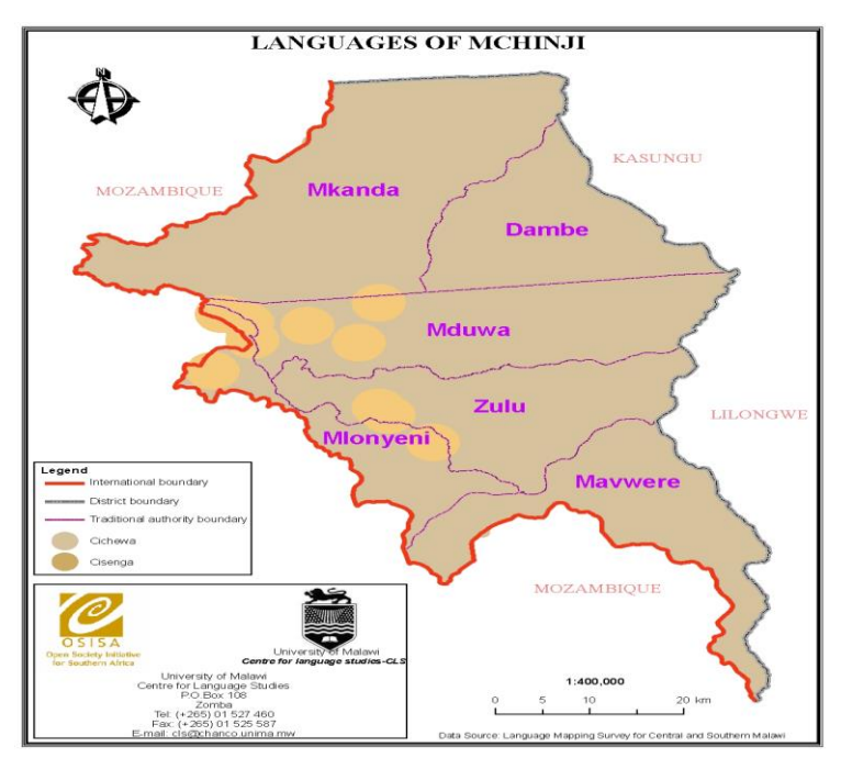
Figure 1. Language Mapping of Traditional Authorities (TAs) in Mchinji District.