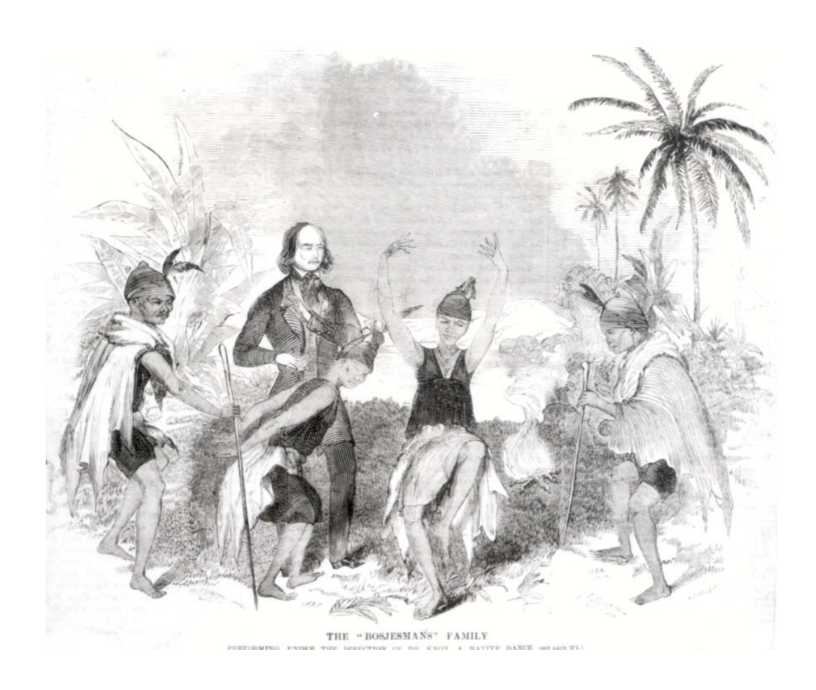
Figure 4. Pictorial Times, June 12th 1847, p. 376.

true, just as these are in some points frightfully human" (Livingstone 1875: 35). Whether this was a fair assessment or not, British artists and illustrators who drew the Bosjesmans evidently agreed with it entirely.