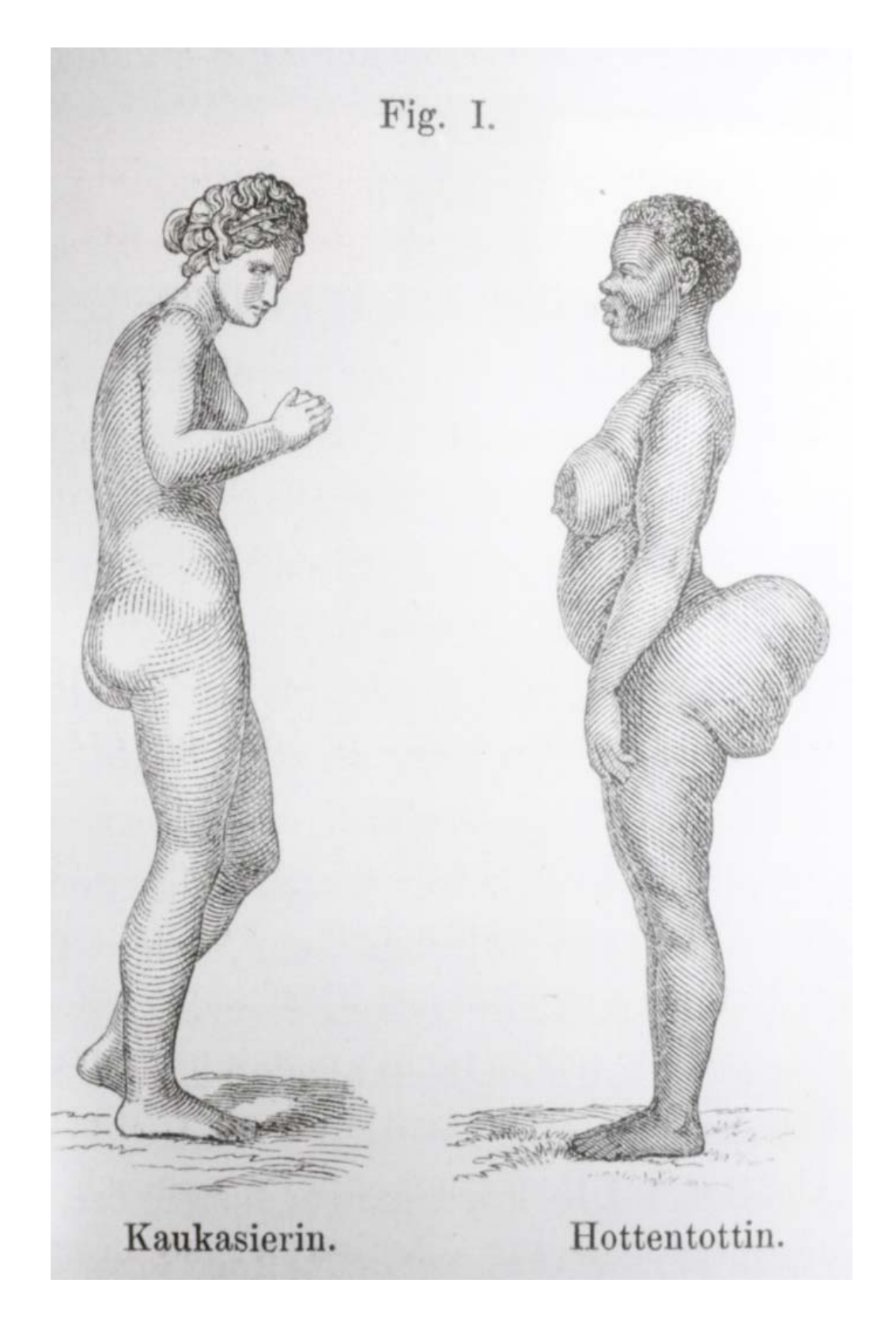
Figure 3. Hubert von Luschka (1864), Die Anatomie des menschlichen Beckens , Vol. 3 of Die Anatomie des Menschen in Rücksicht auf die Bedürfnisse der praktischen Heilkunde , Tübingen: H. Laupp, Vol. 2, p. 8.