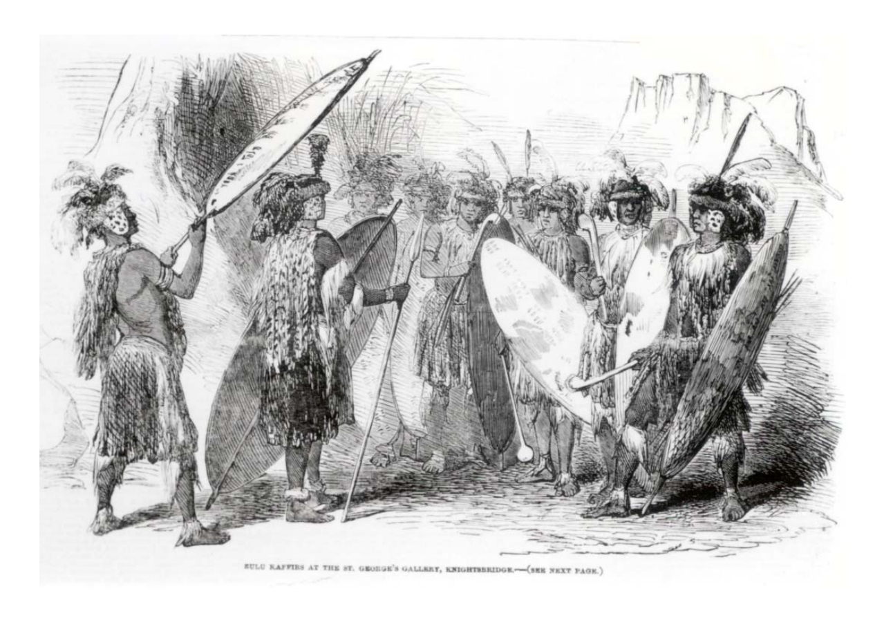
Figure 6. Illustrated London News, May 28th 1853, p. 409.

easily be held up as examples of an underdeveloped race obviously in need of moral improvement and mental refinement. Yet it is interesting to note with what contempt he and other humorists viewed Zulu traditions and institutions, for underlying such ethnic satire was a broad streak of undisguised racism, a belief that Zulus were in every way inferior to Europeans. The numerous comments on their smell, their bizarre modes of dress (and undress), their noises, their monotonous songs, rabid incantations, and wild, demoniacal dances, betray an arrogant assumption that the Zulus were overgrown children of nature who had not yet developed the inhibitions, self-discipline and polite manners that distinguish more civilized folk. They were savages pure and simple, primitives in the raw.