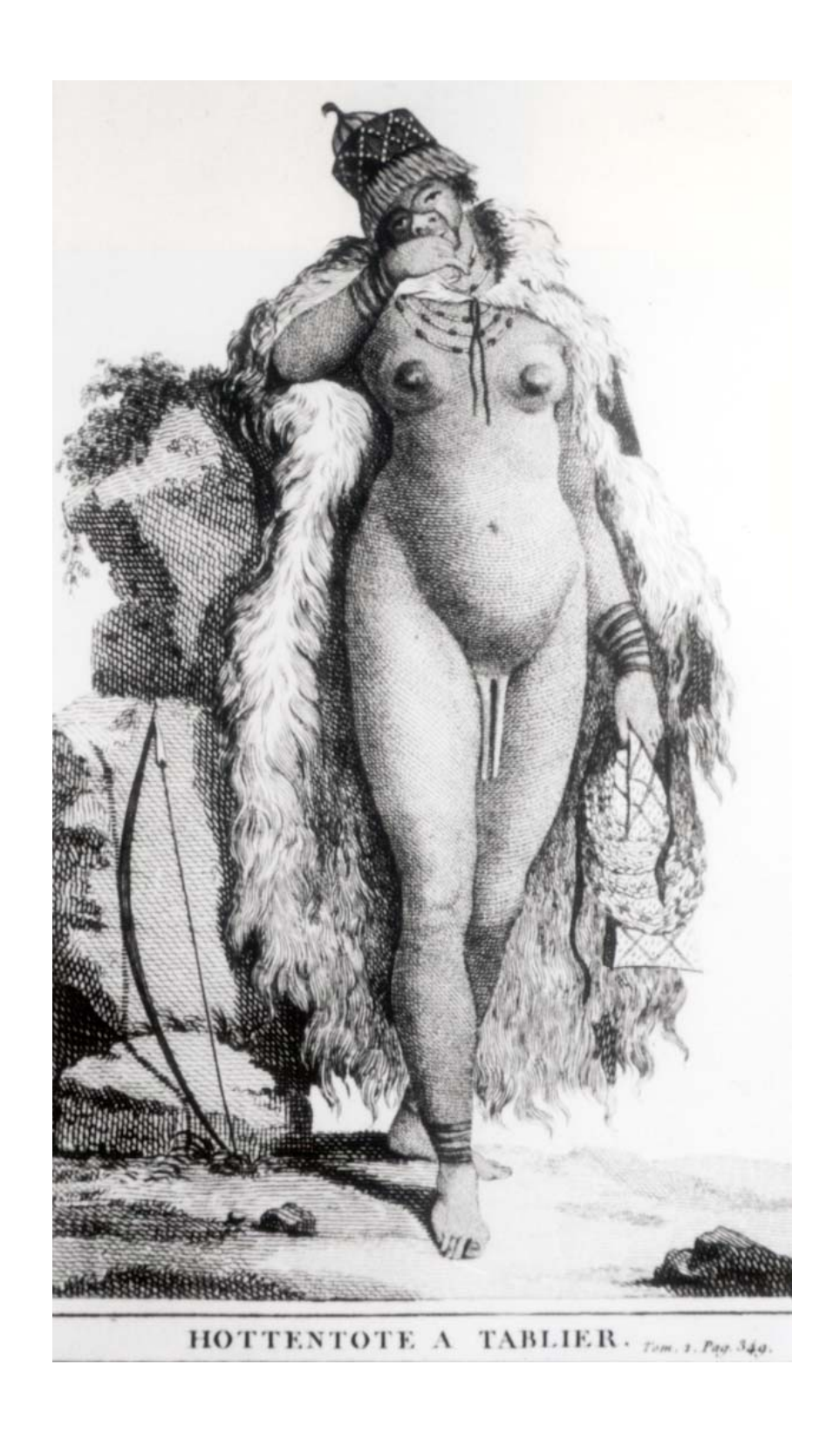
Figure 2. François Le Vaillant (1790), Voyage dans l'intérieur de l'Afrique par le Cap de Bonne-Esperance , Vol. 2: 349.