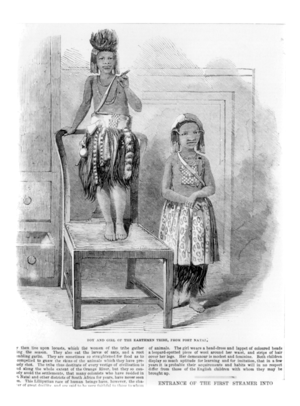
Figure 5. Illustrated London News, November 6th 1852, p. 372.