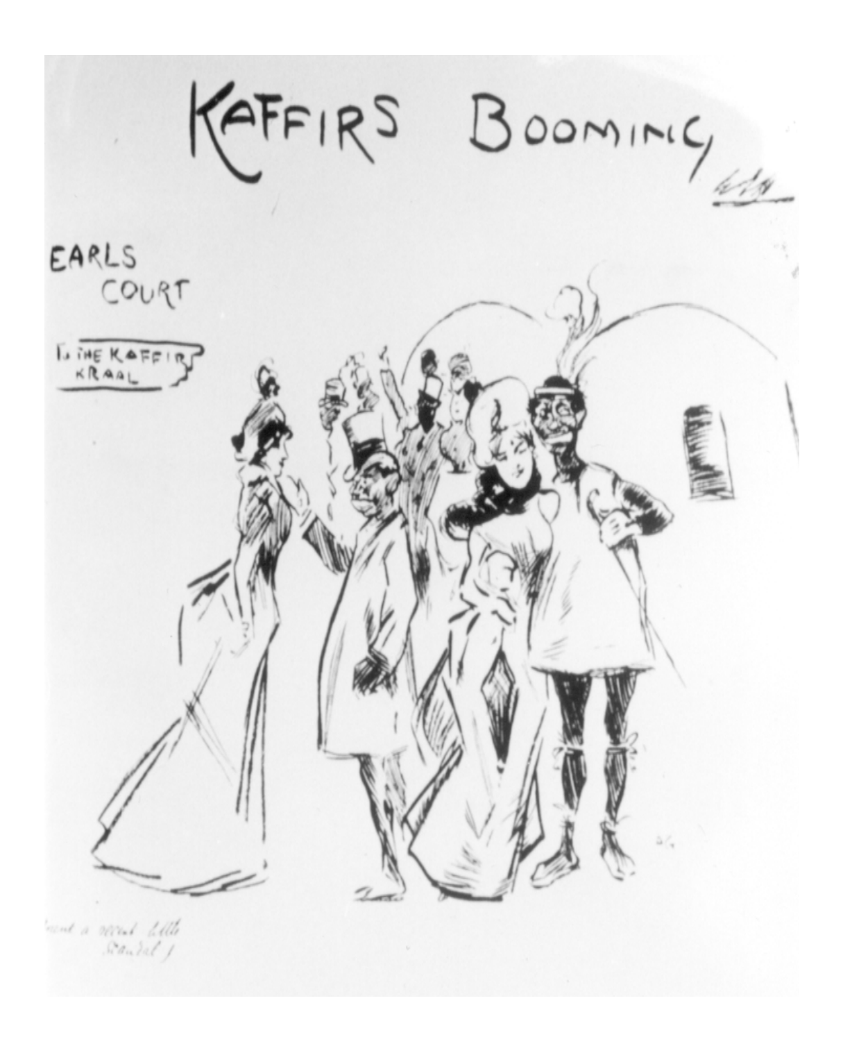
Figure 8. Dudley Hardy, "Kaffirs Booming," a caricature from my own collection.