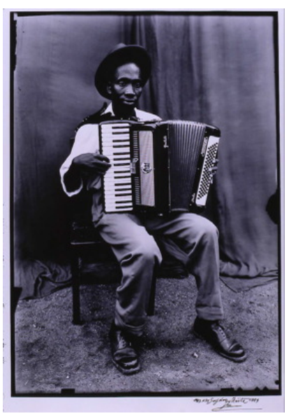
No. 2 Seydou Keïta, 'Untitled', 1952

Following these ideas, the position of the author, of the reader, as well as the interpretation of the artwork, are always the results of a complex process of negotiation, in which the social, the cultural, and the personal dimensions intercept in a specific space/time setting. The journey Keïta's portraits embarked upon travelling all over the world from Bamako and back, determined many transformations related to the different ways in which the characters of this negotiation articulate themselves.