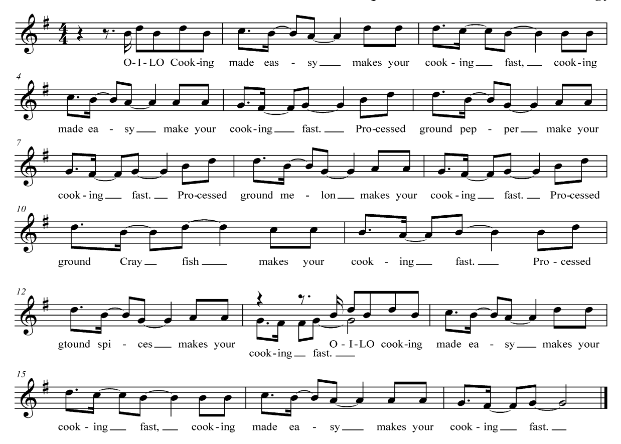
A Unique Promotional Music Strategy