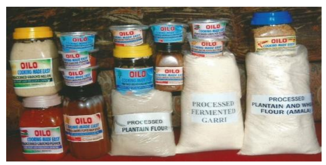
Figure 2. OILO Cooking Made Easy Products.

Shariff and Zakaria (2011:69) write about Malaysian foods as intangible cultural heritage with unique characteristics, which reflect the multi-racial aspects of Malaysia where the dishes have derived from multiple ethnic influences. The products of Mrs. Itedjere derive from various ethnic groups in Nigeria. Although some of the products can be used to prepare various kinds of foods common to many ethnic groups, some have peculiar characteristics that distinguish foods associated with specific ethnic groups.